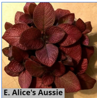
E. Alice's Aussie

Featuring Flashy Foliage Episcias Are an Easy-Care Relative of African Violets