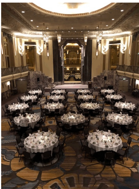
Hall of Mirrors - Awards Banquet