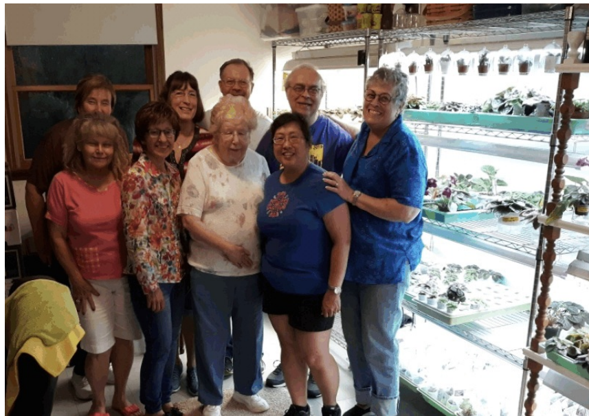
The rain didn't dampen the spirits of the hearty souls that attended the June club picnic.