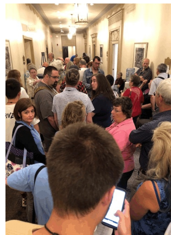
The number of your registration order set the order of the line into the Plant Sales Room