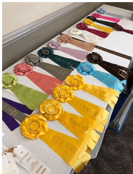
Special Award Ribbons