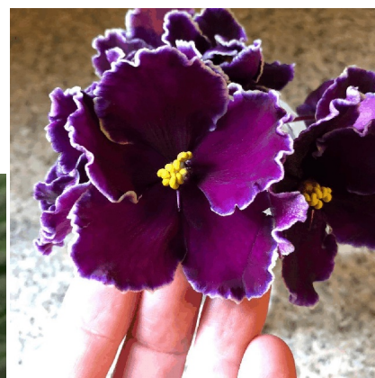
Huge 'Edge of Darkness' blossom