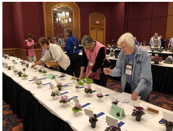
Judging is underway