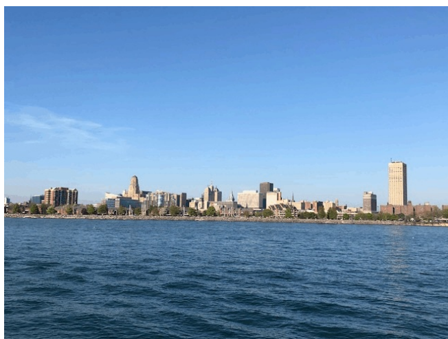
Buffalo skyline as seen from the Harbor Cruise Boat