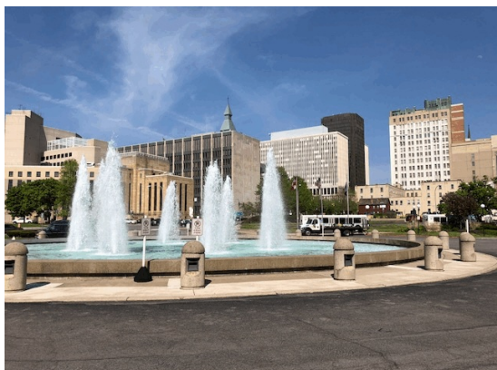
Buffalo skyline from the fountain plaza of the Adam's Mark Hotel