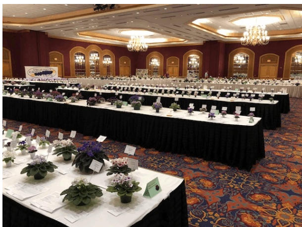
Partial view of the HUGE Showroom. To get an appreciation for the size of the room, note the 4'x8' Educational Exhibit waaaaay in the baaaaaack against the wall of the room.