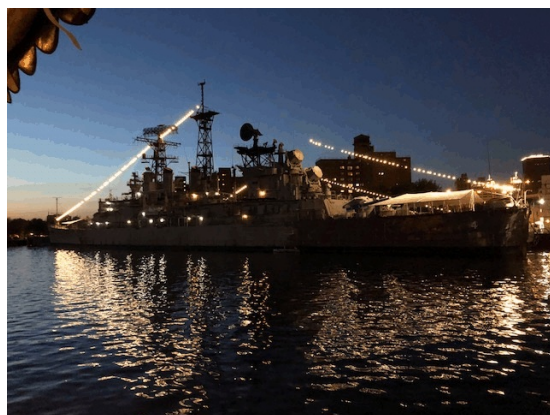
USS Little Rock at the Buffalo & Erie County Naval & Military Park