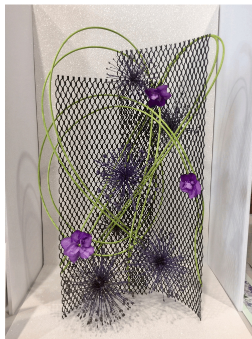
Views of the Ohio State African Violet Society Show