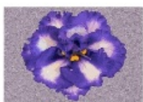
Ma's Blue Penguin

"Happiness is a by-product of doing what makes us feel fulfilled." (Dr. Benjamin Spock)